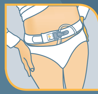
Using the Ugo Fix Catheter Strap on abdomen